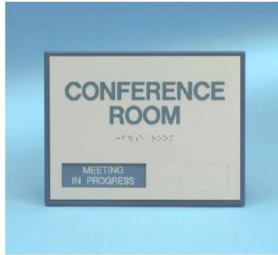
Sign framed with Injection-Molded Modular Frame.

For some interiors, a framed sign will tie into other interior design elements and provide a finished look. A frame tends to guide the eye to the message. In other cases, the designer might prefer a frameless look. In either case, the mounting functions of the frame are still available when the frame is used as a backer for the sign face. When the sign text must be changed, the face can easily be removed and replaced.