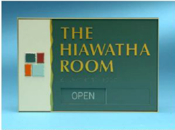
Sign framed with Modular Aluminum Series 100 Frame.